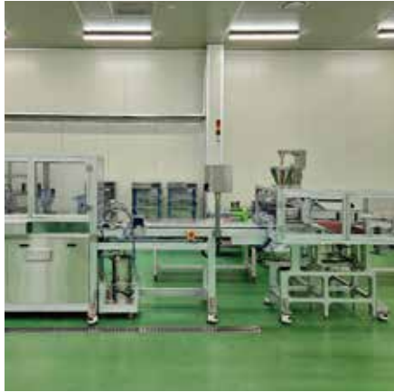
Burrito Wrapping Machine 卷饼包装机