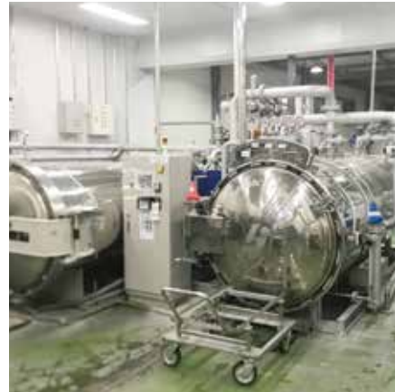
Retort Sterilizer 蒸馏消毒器