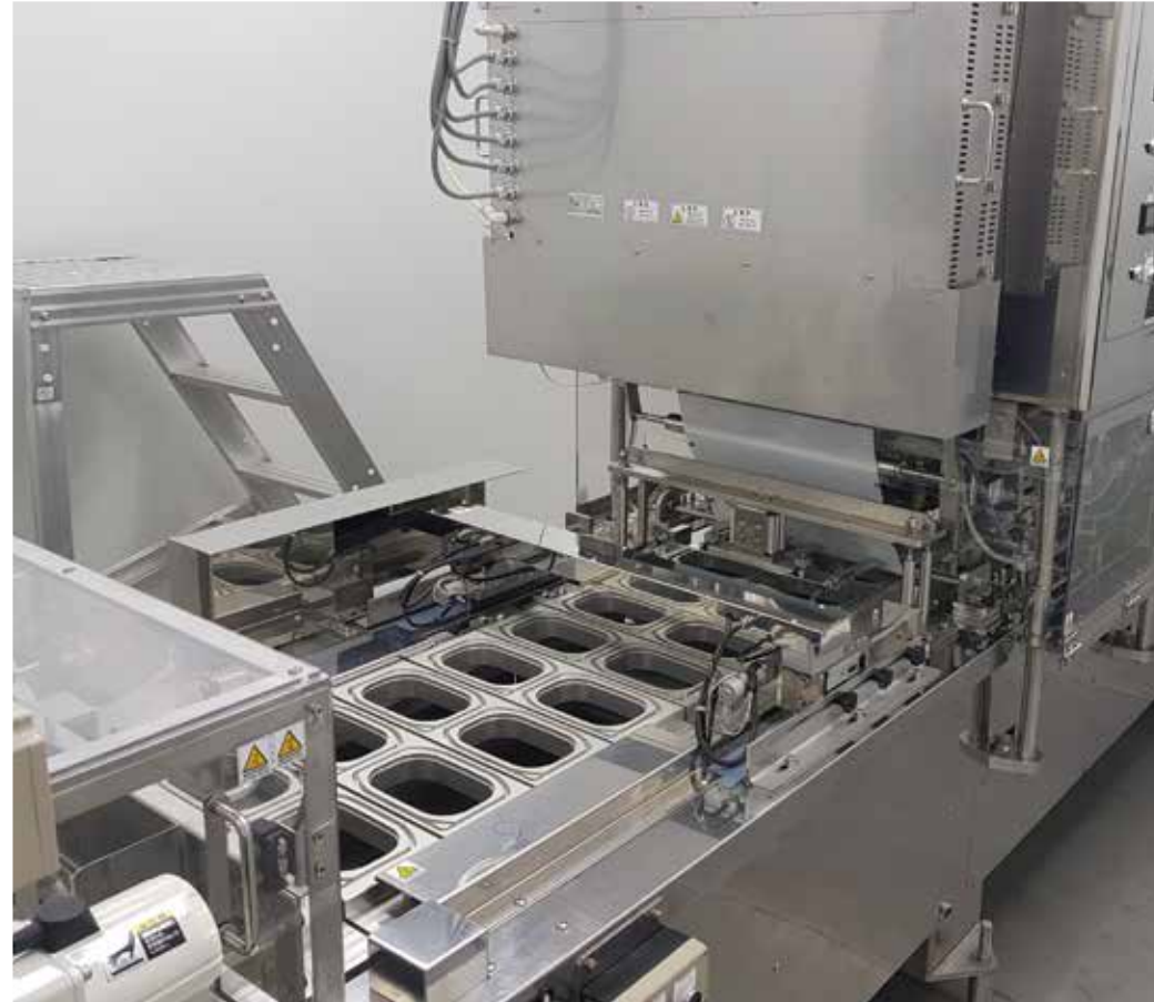
▶ Tray Packaging Line for Ready Meals