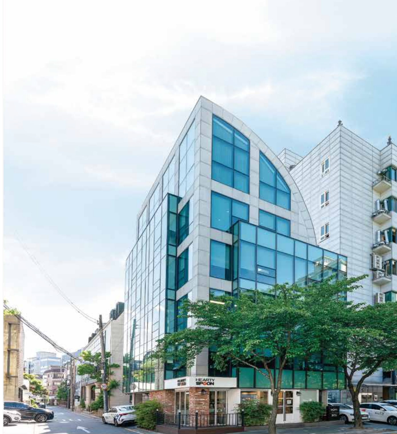
元日食品 首尔办公室 | Wonil Seoul Office

Sales Division, Int'l Business Dept, R&D Dept, Business Management Division, Marketing Dept.