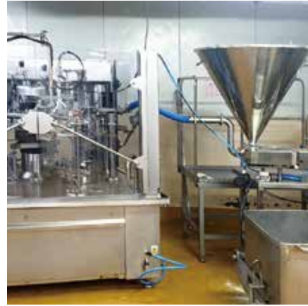
Marinated Meat Packaging Machine 卤肉包装机