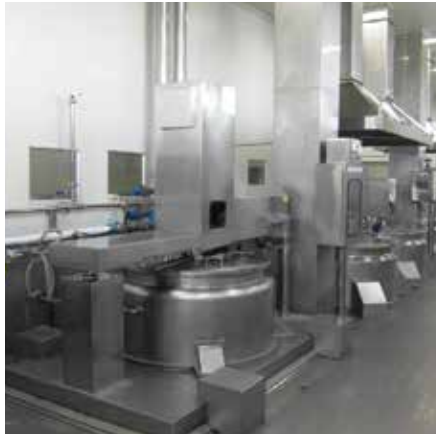
Liquid Mixer 液体搅拌机