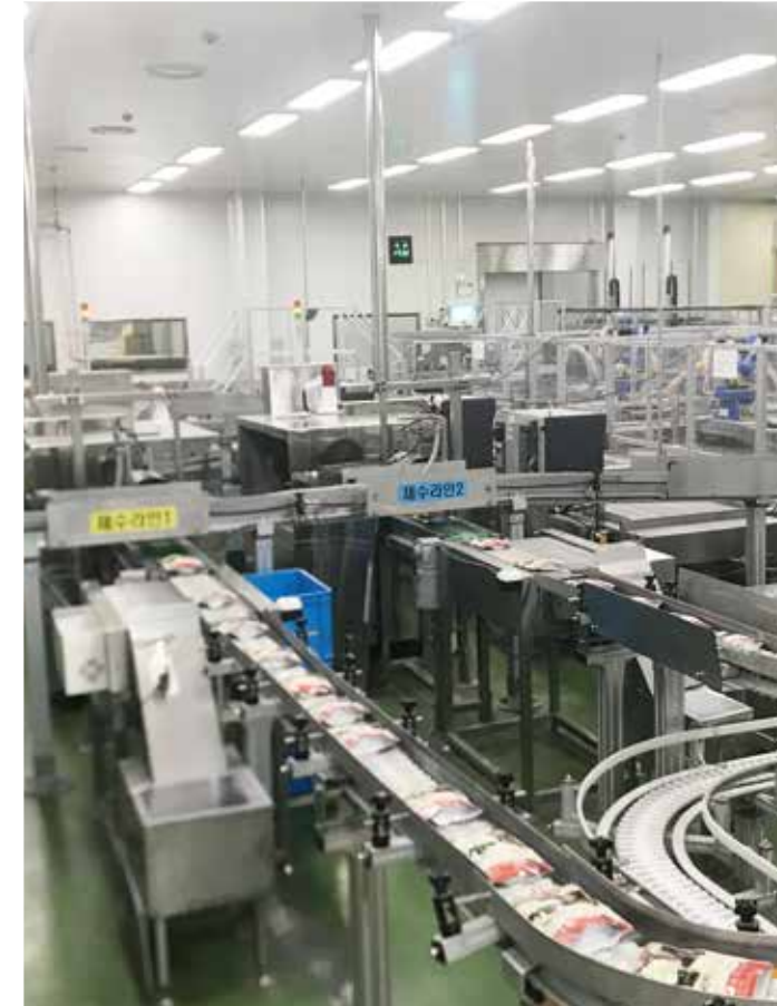
▶ Automatic Sterilization Line